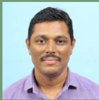
Kale SN Maint