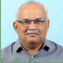
Madhu SS Mfg