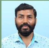
Paswan R Mfg