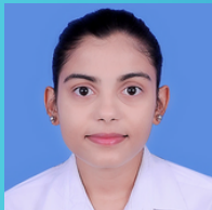
K YAMINI TECH- PROD. PLNG