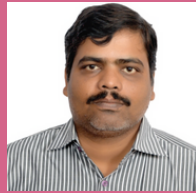
KAMBLE RJ MFG