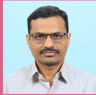
SURYAVANSHI S H DIGITAL