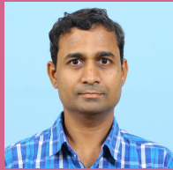
NANDANWAR P T PROCESS TECH