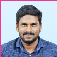
DIVIN K TECH-ENERGY