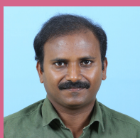
TINY K A MFG-II