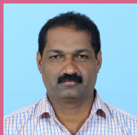
BIJU N L MFG-II