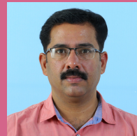
SOJI JOS MFG-II