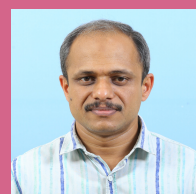
ABDHULLA A A MFG-II-FCCU