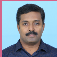
PRAKASH R N MFG -CDU-2