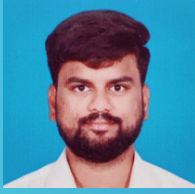
KARTHIKEYAN VINOD / P&U