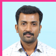
AMON TCR P&U