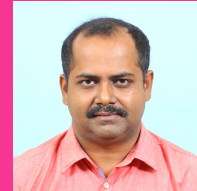
SAHAYA LIBIN MENT D / MAINT