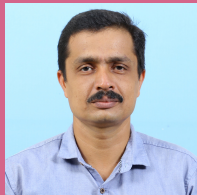
SUNIMON S MFG-ARU