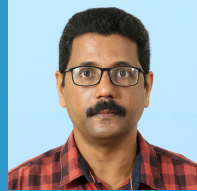
BINIL I MFG