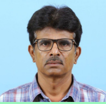
LINDON P V Maintenance