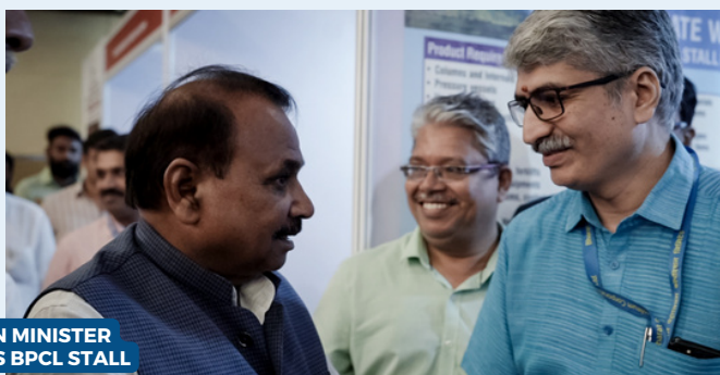
HON MINISTER VISITS BPCL STALL

The Ministry of Micro, Small and Medium Enterprises (MSME) -Development and Facilitation Office Thrissur organised the National Vendor Development Programme on 17,18 November 2022 at Gokulam Park Convention Centre, Kochi. MSME arranged this program in association with M/s. Cochin Shipyard Ltd, Kochi.