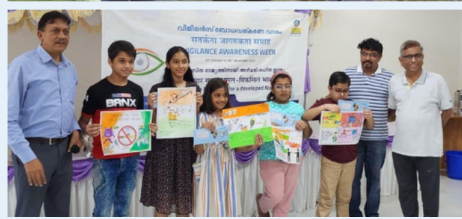
VAW 2022 PRECURSOR ACTIVITIES