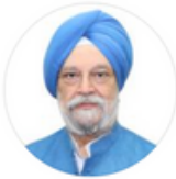
Hardeep Singh Puri ✓