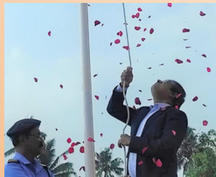
BPCL Vandieptta Township