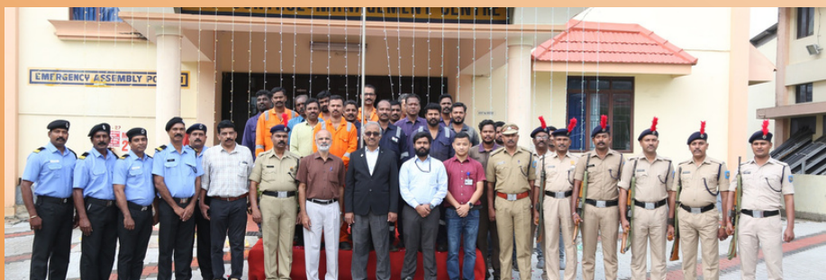
BPCL Shore Tank Farm, Puthuvypen