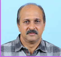
CHACHAPPAN C MANAMAIL / QC