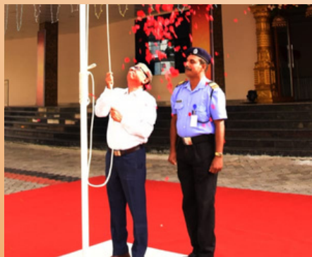
BPCL Marine Drive Complex