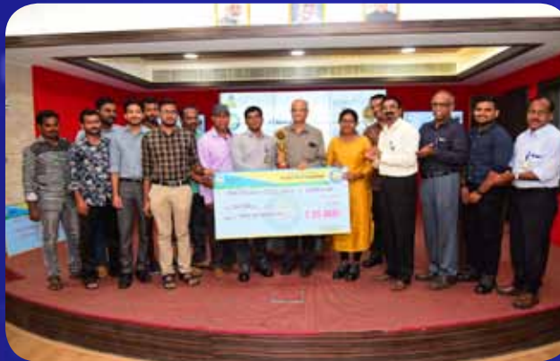
1st Runner up : Team CDU-3 received a trophy and prize money of Rs. 25000/-