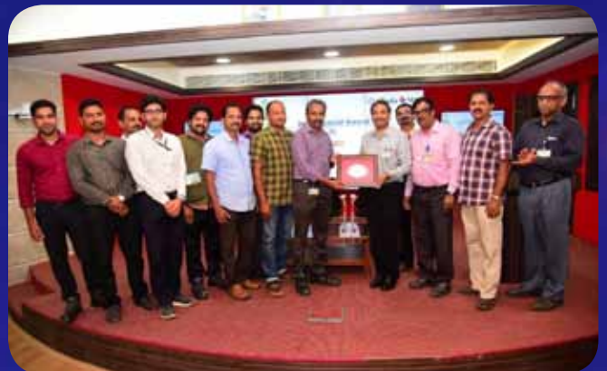
Team Tank Farm - 1