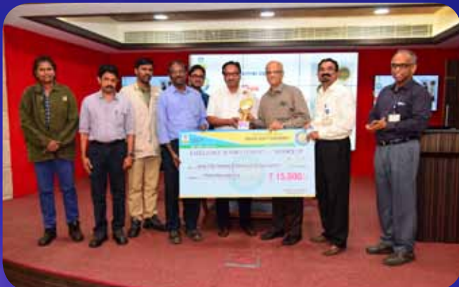
1st Runner up : Team T&PA received a trophy and prize money of Rs. 15000/-