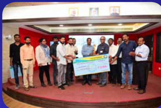
2nd Runner up : Team NHT-ISOM received a trophy and prize money of Rs. 15000/-

Process Safety Management (PSM) is an enabler in setting new benchmarks in the field of Safety at the macro level by managing systems, processes and behaviours at micro level and also strike a good balance between processes and safety, leading to enhanced safety and productivity.