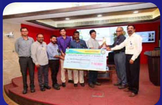
2nd Runner up : Team PSI received a trophy and prize money of Rs. 10000/-