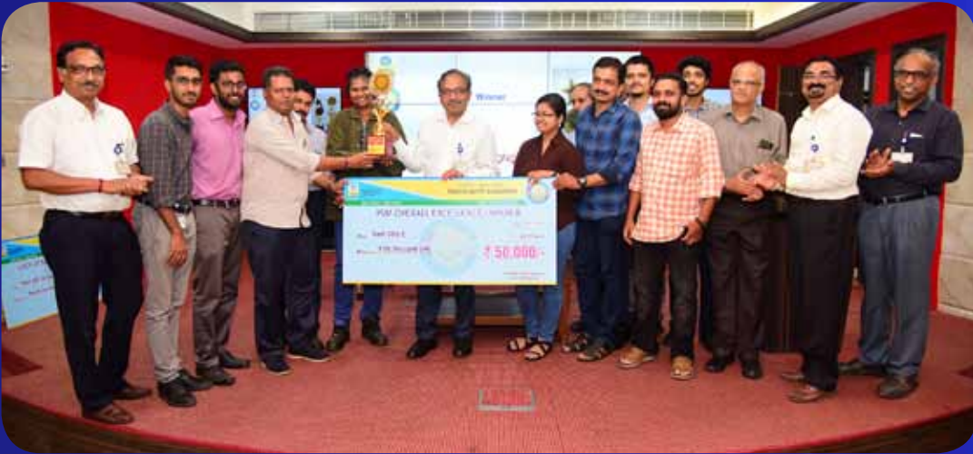
Winner : Team CDU-2 received the Champions Trophy and prize money of Rs. 50000/-