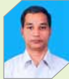
China Mothi Lal Ketavath Petchem