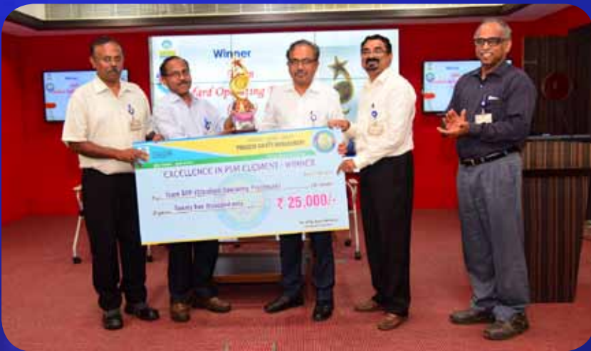
Winner : Team SOP received a trophy and prize money of Rs. 25000/-