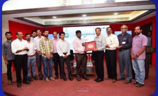
Team Utility (Refinery)