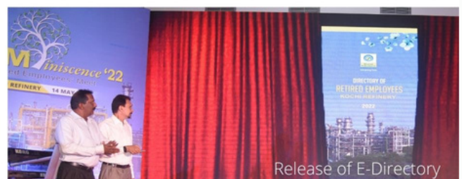
Release of E-Directory