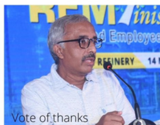
Vote of thanks