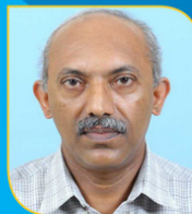
Sabu D MFG-1, DHDS