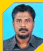
Jayalal N B Fire & Safety