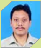
Liston F Maintenance