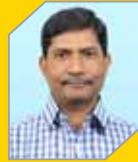
Dekate M HSE-QMS