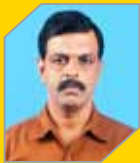
Vasudevan K Fire & Safety