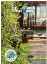
Blue Tiger at KR Eco park