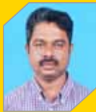
Jainee K A MFG