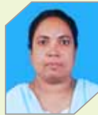
Bijumol B CPO (KR)