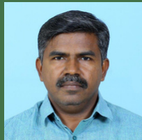
Soyi K J Mfg