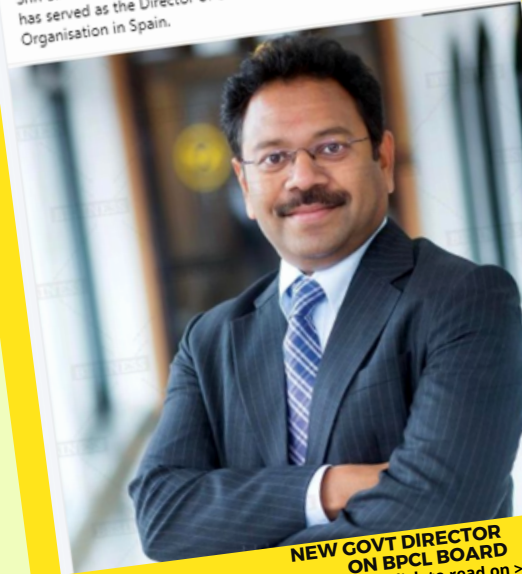
NEW GOVT DIRECTOR ON BPCL BOARD click to read on >>