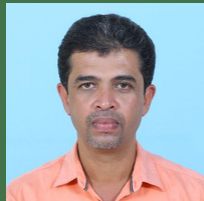
Joseph M R Mfg