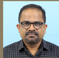
Praseed KA Mfg -II