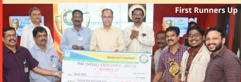
First Runners Up