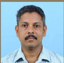
Manoj AP Mfg II