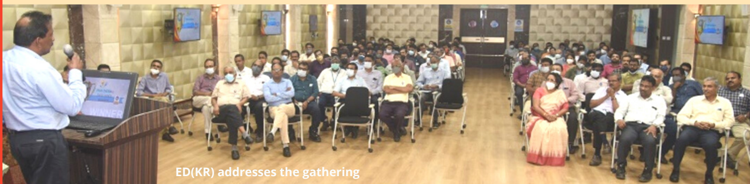
ED(KR) addresses the gathering