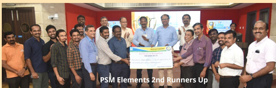
PSM Elements 2nd Runners Up