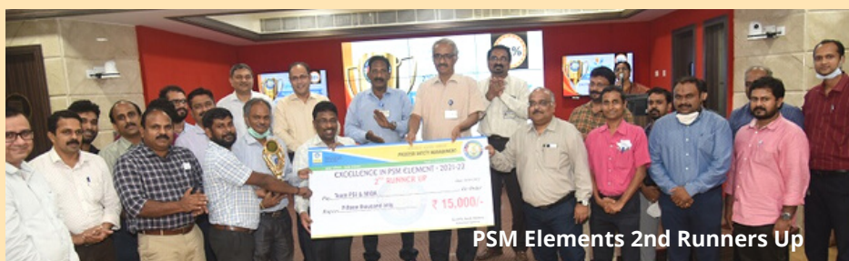
PSM Elements 2nd Runners Up