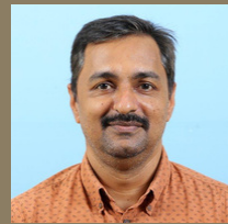
Pradeep PN Mfg