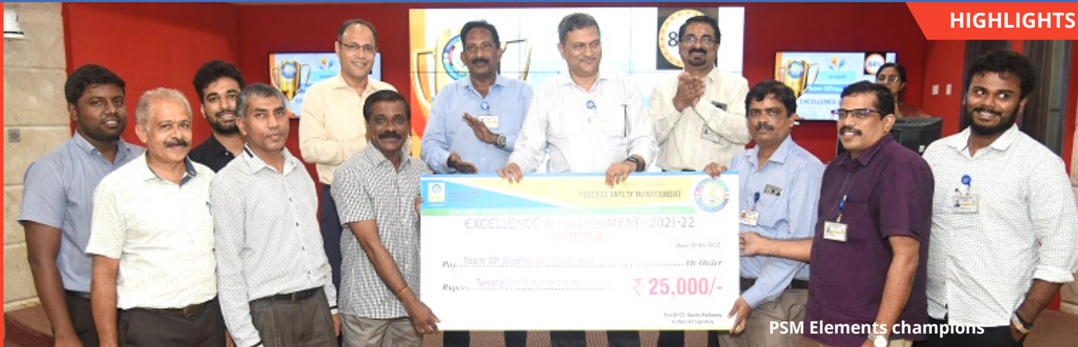
PSM Elements champions