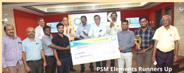
PSM Elements Runners Up

The ideology of Process Safety Management at Kochi Refinery is best explained in our motto Together Let's move ahead from good to great systems through PSM, and that is where the entire team Kochi Refinery has invested our efforts.