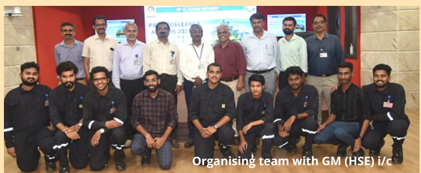
Organising team with GM (HSE) i/c