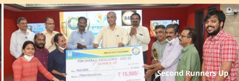
Second Runners Up