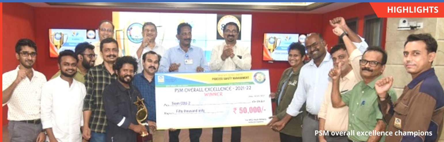
PSM overall excellence champions