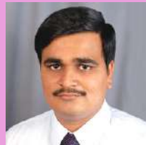
A KAMAL RAJ FINANCE