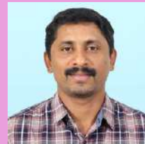
BIJUSH C B MFG