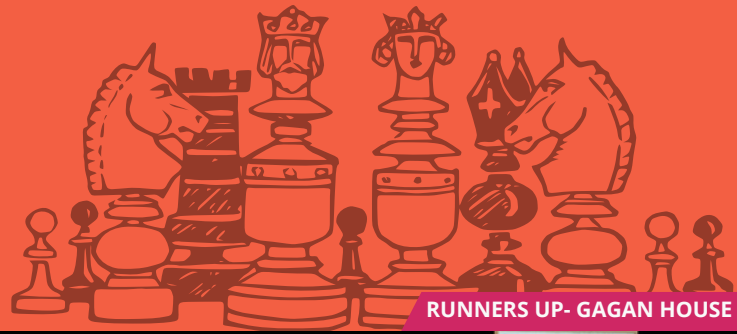
RUNNERS UP- GAGAN HOUSE