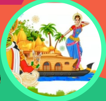
CHAMPIONS - AGNI HOUSE