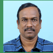
Shibumon P B P&U