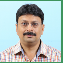
Gokuldas V K P&U