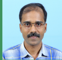
Stebimon K D P&U