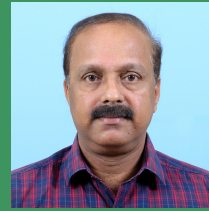
Venu T P&U