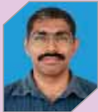
Sabin Davis Projects-MSBP