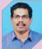
Suresh K S Manufacturing