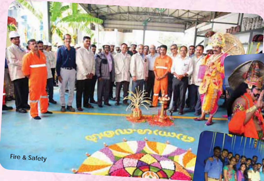
Fire & Safety