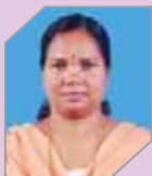
Usha Nurichan Fire & Safety