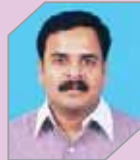
Chandresh S Project Technical Tech - Optimisation