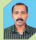
Shyin P S P&U - Electrical