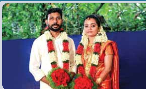
Rimil / MFG 1 VGO SRU and Sruthisha