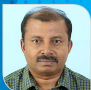
Babu M OM&S /TF-2