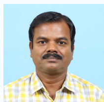
Sasi PK / E&C