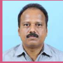
SYAMRAJ O R OM&S