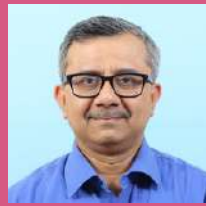
CHATTERJEE S MAINTENANCE