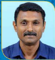
Clement KA MFG-1, DHDS