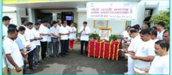
Employees & CISF team take the SwachhBharat pledge led by ED(Proj) at BPCL Kochi Refinery on 2 Oct 2017.