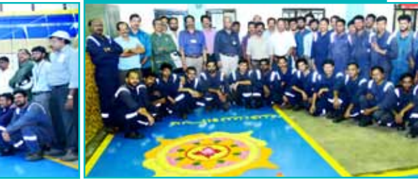
Area 4 Maintenance