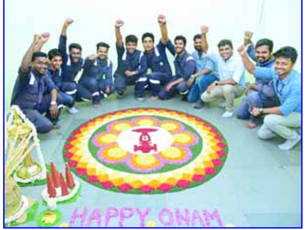
DHDS - Maint Instrumentation