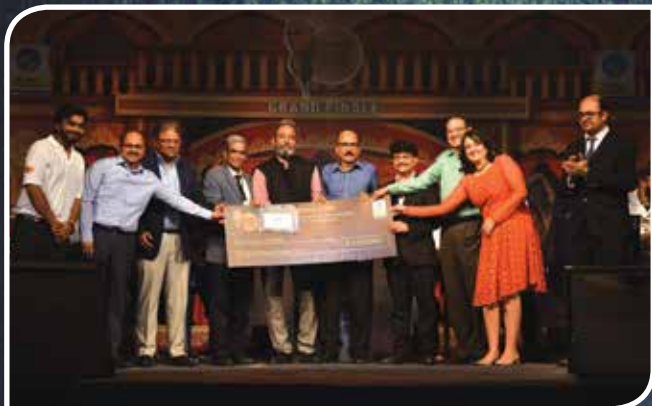
I&C with 85.6% participation : Winner