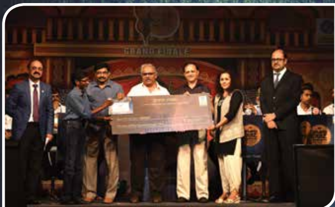
CPO with 96% participation : Winner