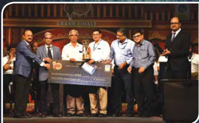
West Bengal with 73.6% participation : Winner