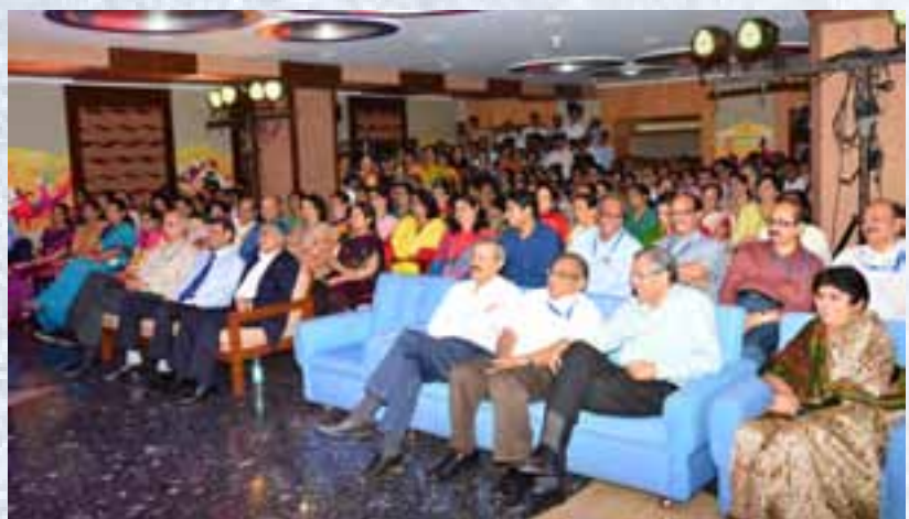
The audience enjoys the Hindi skit.