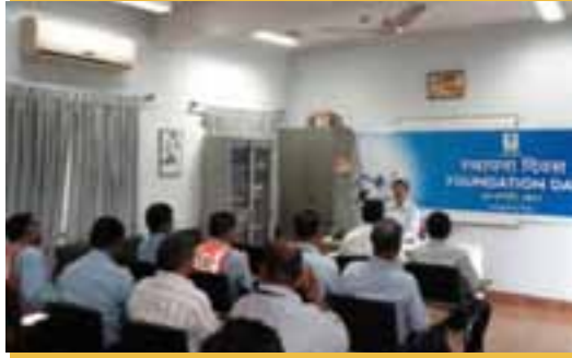
Kolkata AFS- Quiz in progress

Foundation Day celebrations in the true sense are sharing the journey undergone, the present reality and the future vision with our own teams and customers. All AFS' across the country celebrated the Day with interactive sharing experiences. The customers were delighted to be a part of the celebrations and appreciated our company's achievements highlighted in the Corporate Film. The photos are a testimony to the zeal and fervor generated amongst all.