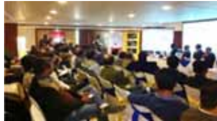
Customer Meet for Lions & Rotary Club Members