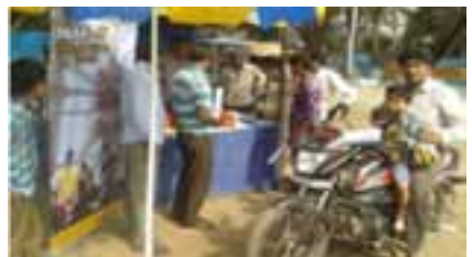
ODW in front of SECL colony Bilaspur