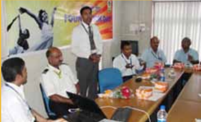
Cochin AFS- Airlines Maintenance Managers sharing their thoughts