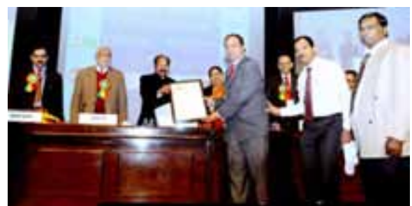
Uran LPG Plant