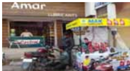
ODW at Retailer Amar Lubricants Jabalpur