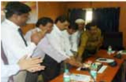
Celebration at India Govt. Mint, Mumbai