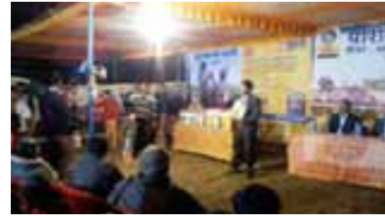
Kisan Mela at Kachrod, Ujjain

Customer engagement and Customer focused activities was the WR Lubes Way to celebrate Foundation Day !