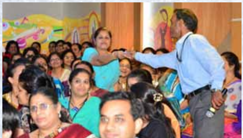
Scoring a win at the BPCL Quiz.