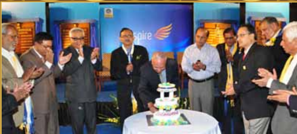
Celebrating BPCL's success with traditional camaraderie and bonhomie