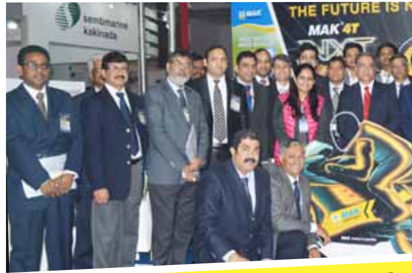
Team BPCL with our C&MD.