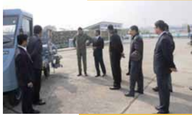
Gwalior AFS- Air Commodore discussing newly built self propelled Hydrant Cart