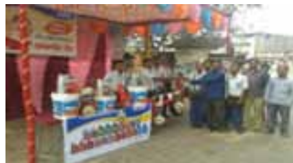
ODW at G B Mehta, Khed under Kolhapur sales area