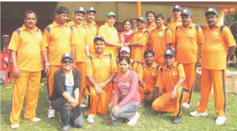
The Winners : Achievers