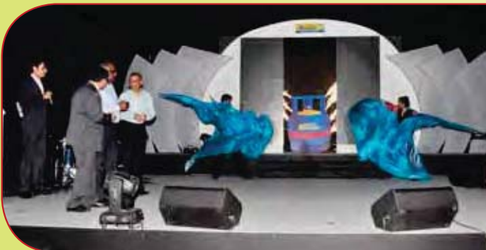
'Dial Bharatgas Mini' Scheme in Mumbai