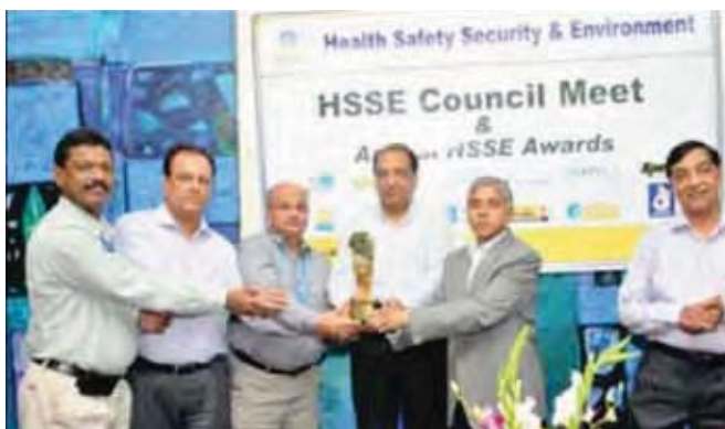
Director (R) presenting an award to the MMPL team