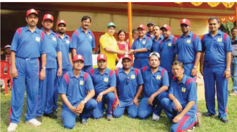
The Runners - up : Warriors