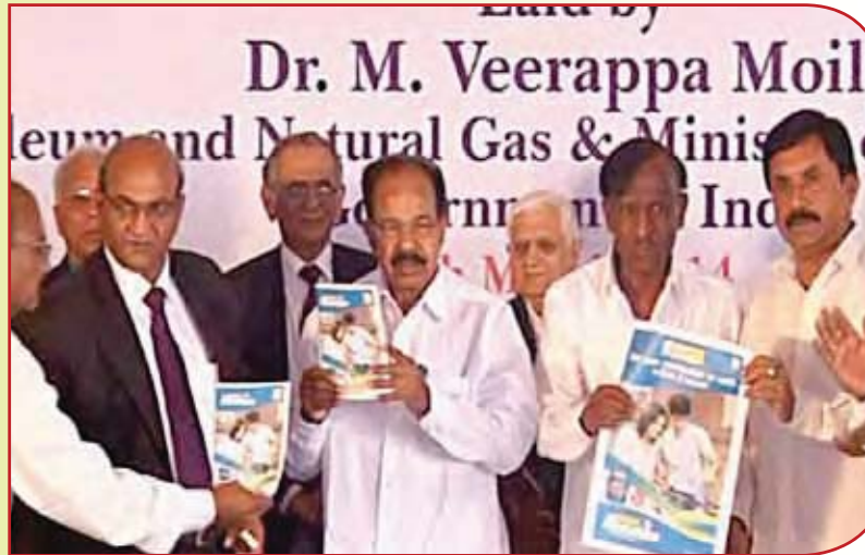
Dr. M Veerappa Moily launches the 'Dial Bharatgas Mini' Scheme.

People desirous of availing a Bharatgas Mini (5 kg cylinder) can dial the toll free number 1800 22 4344 (same for all cities) and order a new connection or a refill cylinder, which will be delivered to their residence within 2 hours ! Orders can be booked on the toll free number 24 x 7 and deliveries will be made from 9 a.m. to 9 p.m.