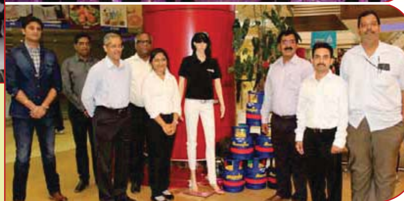
'Dial Bharatgas Mini' Scheme in Pune