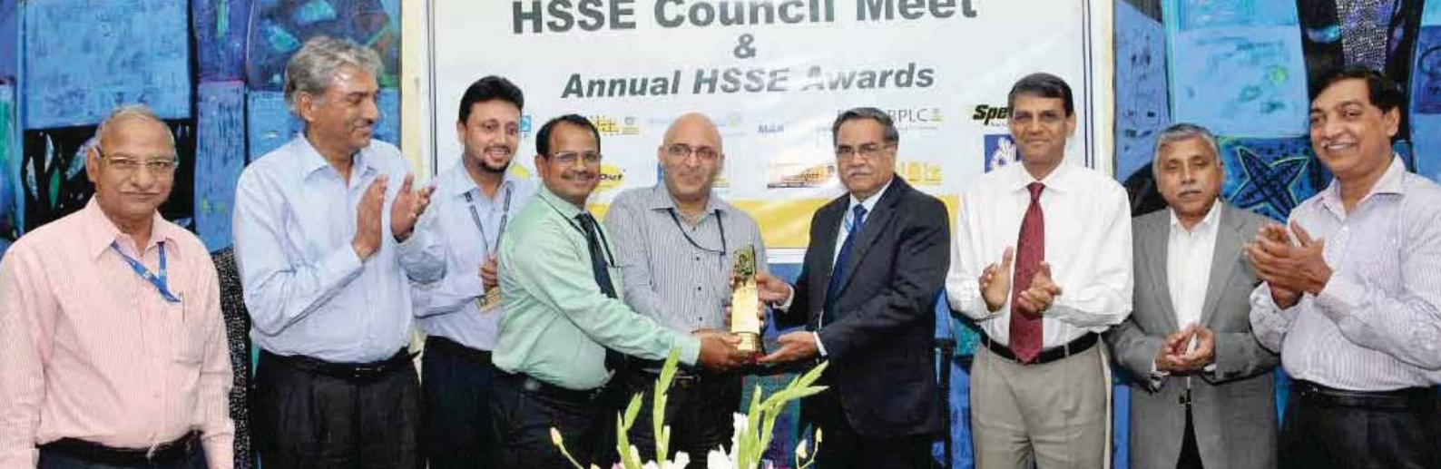
C&MD presenting an award to Cherlapally Retail Installation