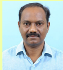
Dhanil CR (P&U)

Routing of stripped water pump discharge from ISWW-202 bottom as reflux for first column (ISW-V-201) in SRU 3, resulting in stoppage of reflux pump of ISW-V-201.