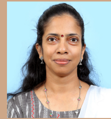
Anuradha Shenoy Digital