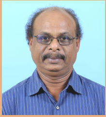
AF Pinheiro Mfg