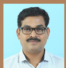
Tusharkanta Sahoo / F&S