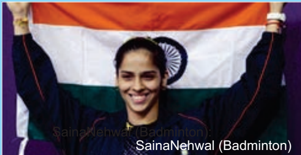
Saina Nehwal (Badminton) Saina Nehwal (Badminton)