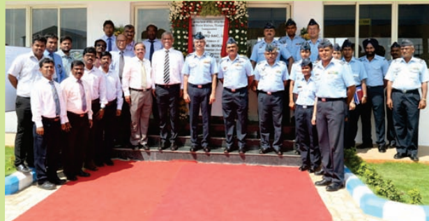
The BPCL and IAF teams at new BPCL Thanjavur Aviation Station