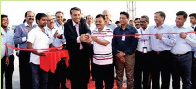
All smiles at the inauguration

We are now fueling Tiger Airways and Air India at Lucknow to begin with and hope to increase our market share & claim a bigger chunk of the ATF biz for both domestic and international segments in the times to come.